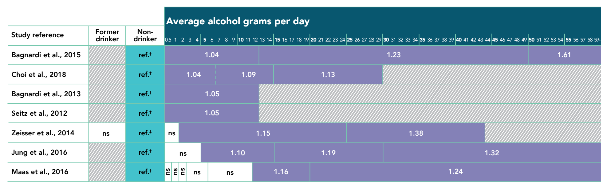
Table 2. Relative risk estimates for alcohol consumption associated with breast cancer for women combined from meta-analyses and pooled cohort studies*