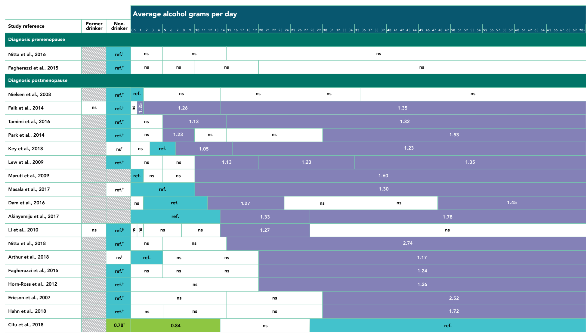
Table 4. Relative risk estimates for alcohol consumption associated with breast cancer based on menopause status for women from individual prospective cohort studies*