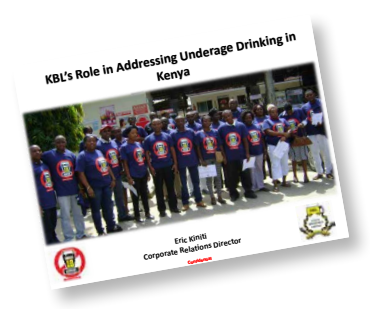
Diageo program in Kenya, 'Under 18 Asipewe'

In Europe, HEINEKEN has continued its long-standing consumer information program in Romania with ALIAT, the main Romanian NGO, providing prevention and treatment services for problems connected with alcohol consumption. HEINEKEN supported ALIAT in launching Alcohelp, the first Romanian online counseling and e-health intervention center for people with alcohol issues. This includes the Alcohelp caravan, which tours urban and rural locations in Romania, and a national map of health services for alcohol misuse, an interactive tool that helped compile a centralized database of the most important health services available to the public. Overall, Alcohelp has reached 70,000 people with messages