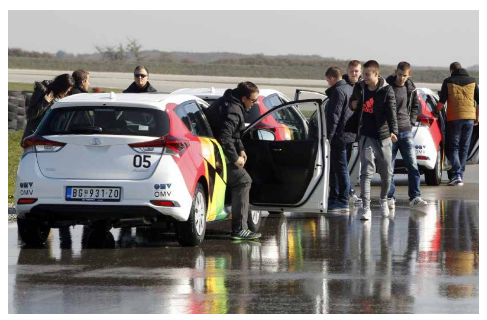
Molson Coors driving program in Serbia