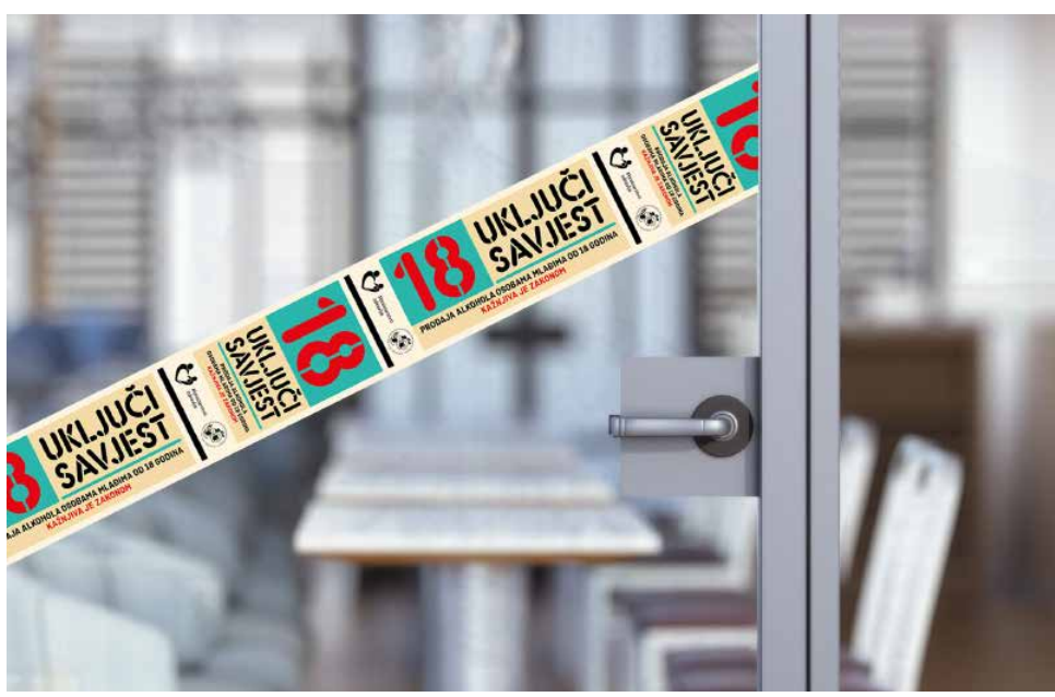
Legal Purchase Age (LPA) warning in Croatia

Working together as an industry in supporting the Beer, Wine and Spirits Producers' Commitments in 100 countries.